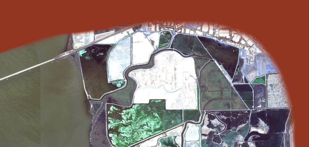
Figure 1. Weed point locations mapped during the 2010 Weed Inventory of South San Francisco Bay

Predicting that we would not complete the inventory in one season, we prioritized areas for mapping based on travel corridors (trails, roads, parking lots, etc.), and current and future restoration sites (Figure 3). In 2010, we were only able to map approximately half of the study area, and expect to complete the inventory in summer 2011. We mapped almost all priority sites within three