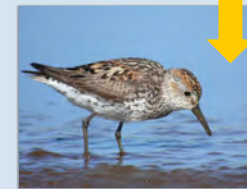
Western Sandpiper declined by 34,000 Baywide (26%).