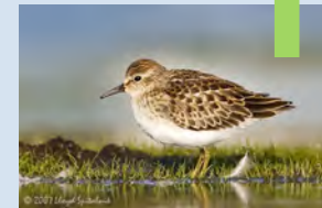
Least Sandpiper increased by 21,000 Baywide (171%).